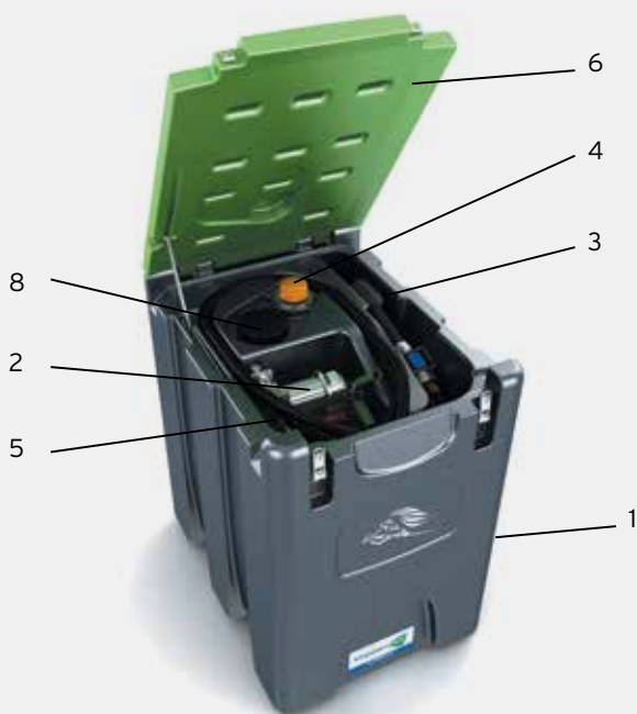
TruckMaster® 300 L

● Standard accessories. ○ Optional accessories.