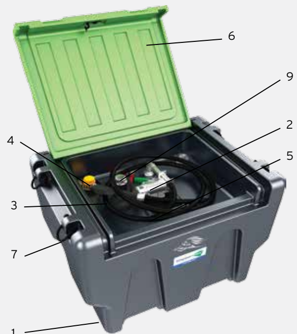
TruckMaster® 430 L